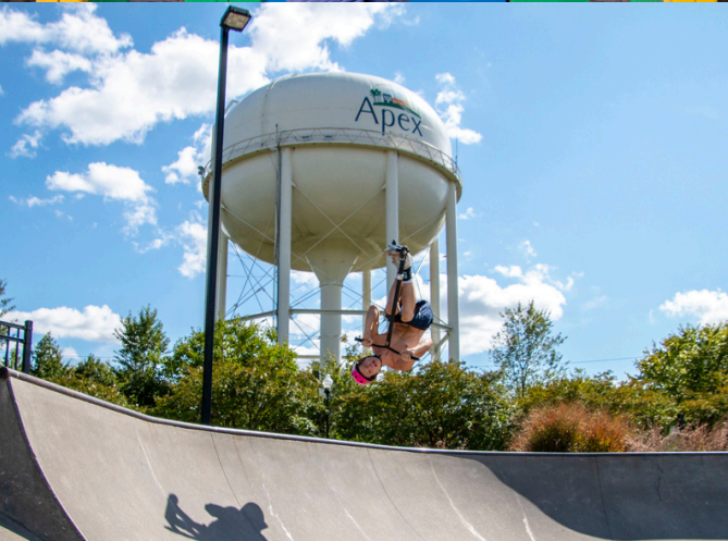
Roger's Family Skate Plaza