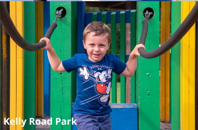
Kelly Road Park