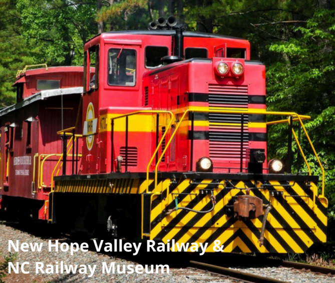
New Hope Valley Railway & NC Railway Museum